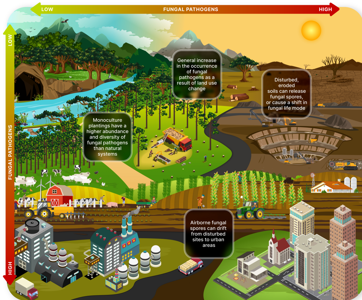
Figure 3. Diagrammatic representation of how land use change can lead to an increase in fungal pathogens. When land use change occurs, such as through deforestation or agricultural expansion, natural habitats and ecosystems are disturbed. This disruption can lead to changes in the composition and diversity of fungal pathogens.

compared to organic farming practices (Hartmann et al., 2015). Hence, the land use types with higher disturbance frequency could suppress plant beneficial micro-organisms and thereby promote plant pathogen diversity (Hartmann et al., 2015). Irrigation and fertilizer input could result in a higher pathogen diversity in managed agricultural systems, possibly by lowering the functions of arbuscular mycorrhizal and so the loss of their impact on reducing pathogens (Hong and Moorman, 2005; Makiola et al., 2019). Excess amounts of fertilizer or an unbalanced nutrient supply can also weaken the plant immunity that usually benefits plant pathogens (Anderson, 2002; Hartmann et al., 2015; Makiola et al., 2019). The factors that underlie how different forms of land use change can impact fungal pathogens are described in Figure 3.